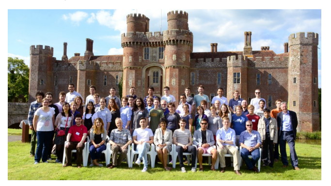
Summer 2015/16 at Herstmonceux Castle