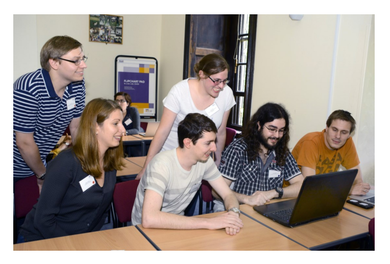
Working together to deliver excellence in Physics

How to write a successful Fellowship Application. This workshop is aimed at those students who are considering an academic career. Most often this starts with a period of post doctoral study during which the researcher is supported by a Fellowship. The workshop focusses on what is required to prepare a successful fellowship application.